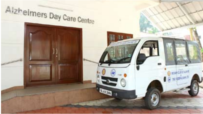
Sneha Bhavan is a joint effort of Federal Bank and Rotary Club of Aluva. Date: 29 th July, 2010.